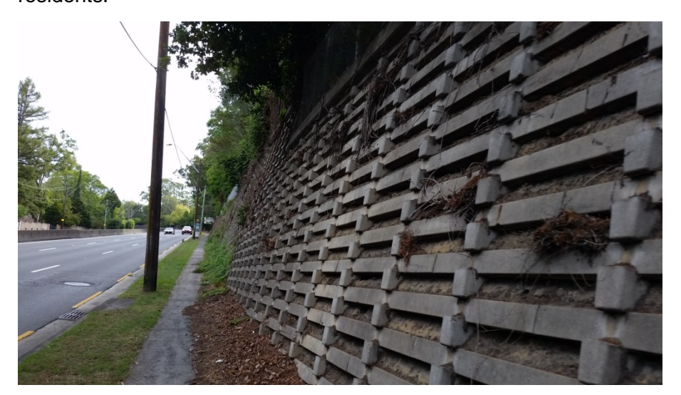
Image 2: Concrete retaining wall to southern end of Mona Vale Road

road has resulted in the loss of setback and setting to many properties. The overall width of the road visually and physically disconnects one side of Mona Vale Road from the other. Large retaining walls and barriers have been created to protect the road and the amenity of residents.