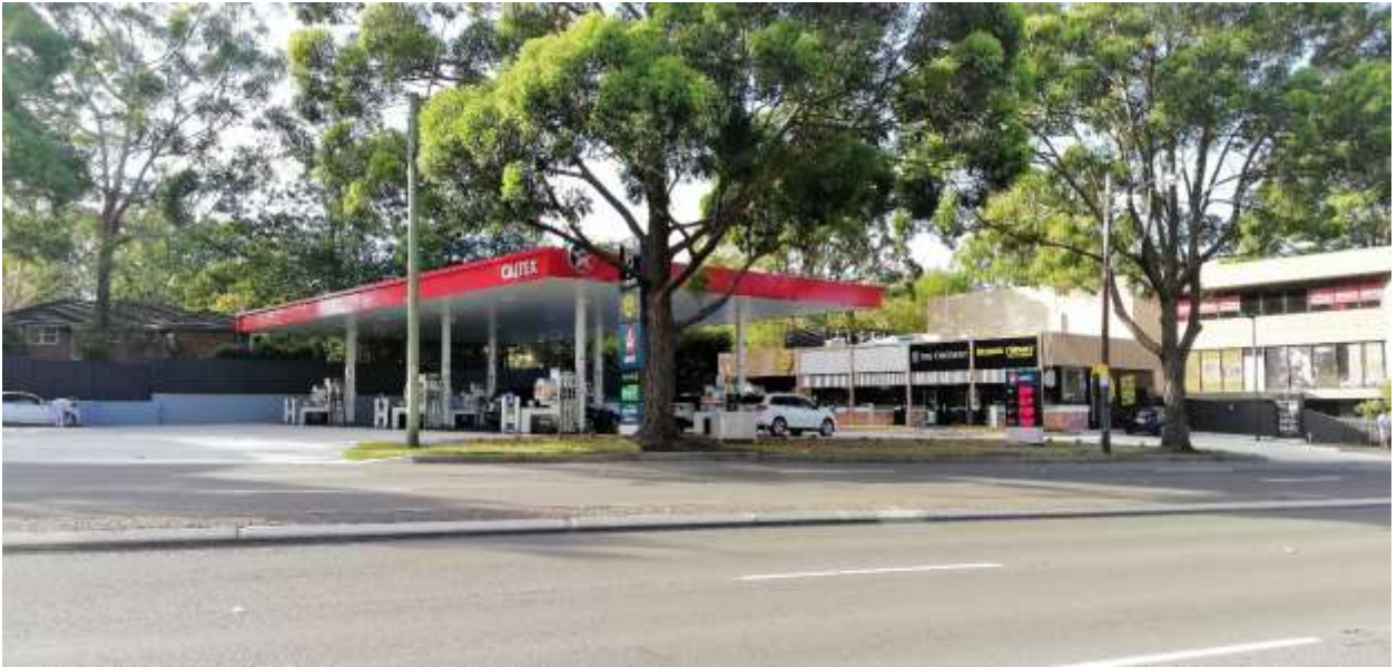
Figure 2: The streetscape opposite the subject site looking north – Caltex service station with fast food outlets