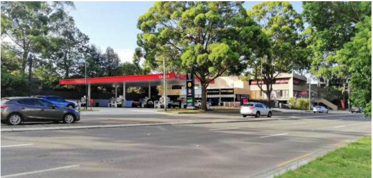
Figure 3: Alternate view - streetscape opposite the subject site looking towards St Ives Shopping Village