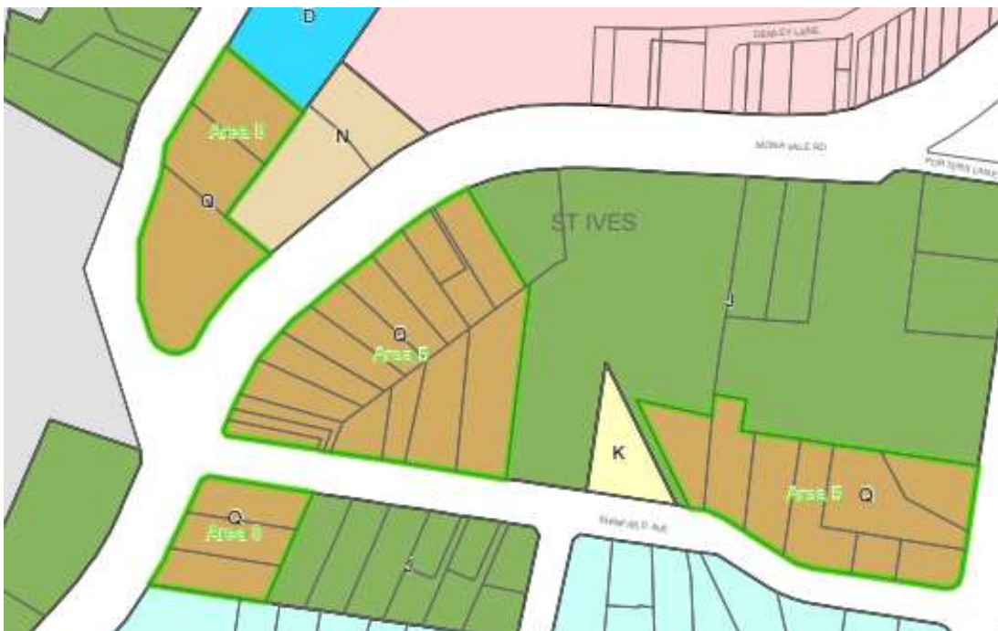
Figure 8: Extract from LEP floor space ratio map of 169-177 Mona Vale Road St Ives. No changes are required to this map.