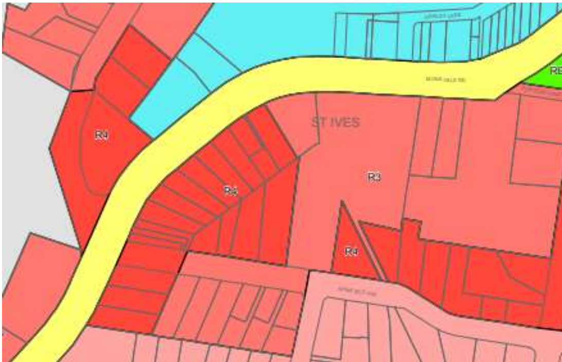
Figure 7: Extract from LEP zoning map noting R4 zoning of 169-177 Mona Vale Road St Ives. No changes are required to this map.

No changes to mapping is required for this planning proposal.