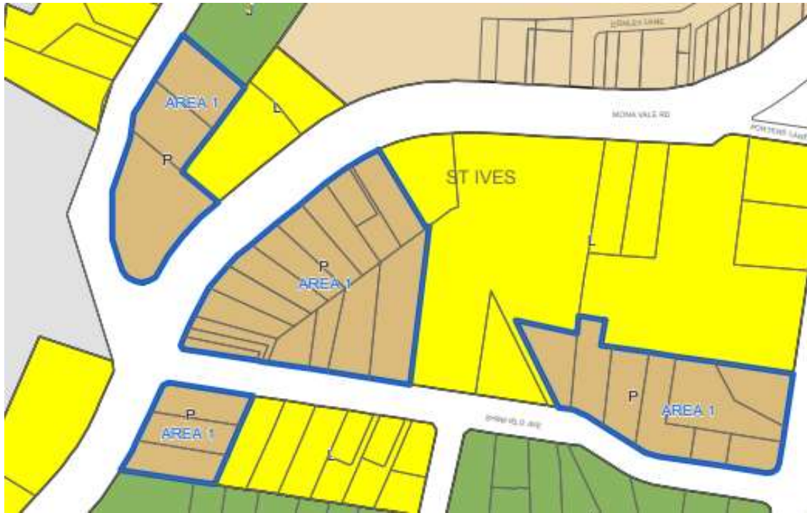
Figure 9: Extract from LEP height of buildings map of 169-177 Mona Vale Road St Ives. No changes are required to this map.