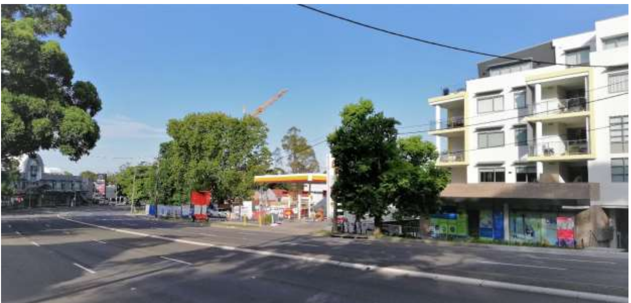
Figure 4: The streetscape adjacent to the subject site looking north east – Shell service station