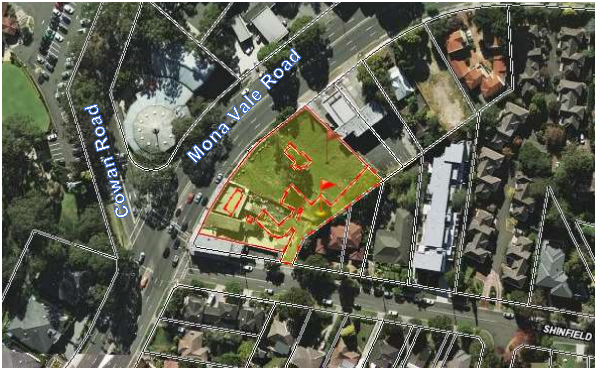
Figure 5: Aerial view of 169-177 Mona Vale Road St Ives (the 'subject land')

For abundant clarity, the intended outcome does not require a rezoning or mapping changes.