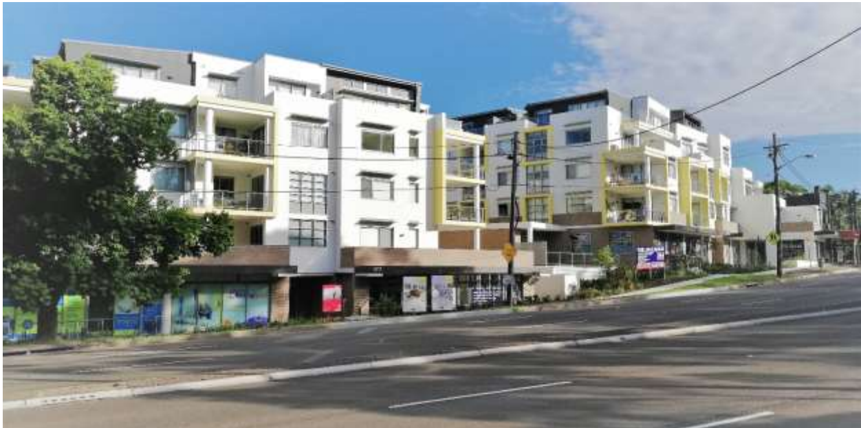
Figure 1: The subject premises – 169-177 Mona Vale Road St Ives

Other permissible uses in the current R4 zone are Attached dwellings; Bed and breakfast accommodation; Boarding houses; Building identification signs; Business identification signs; Centre-based child care facilities; Community facilities; Dwelling houses; Environmental protection works; Exhibition homes; Flood mitigation works; Home-based child care; Home businesses; Home industries; Hostels; Multi dwelling housing; Neighbourhood shops; Places of public worship; Recreation areas; Residential flat buildings; Respite day care centres; Roads; Seniors housing; Shop top housing.