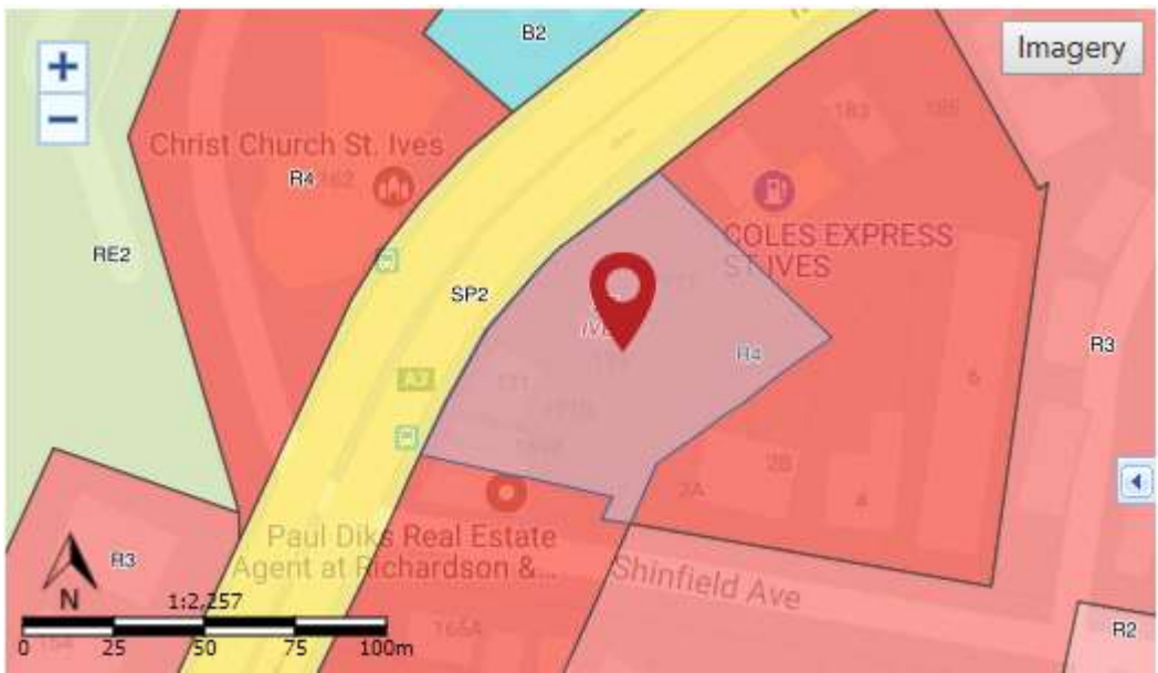
Figure 6: Extract from LEP zoning map noting R4 zoning of 169-177 Mona Vale Road St Ives