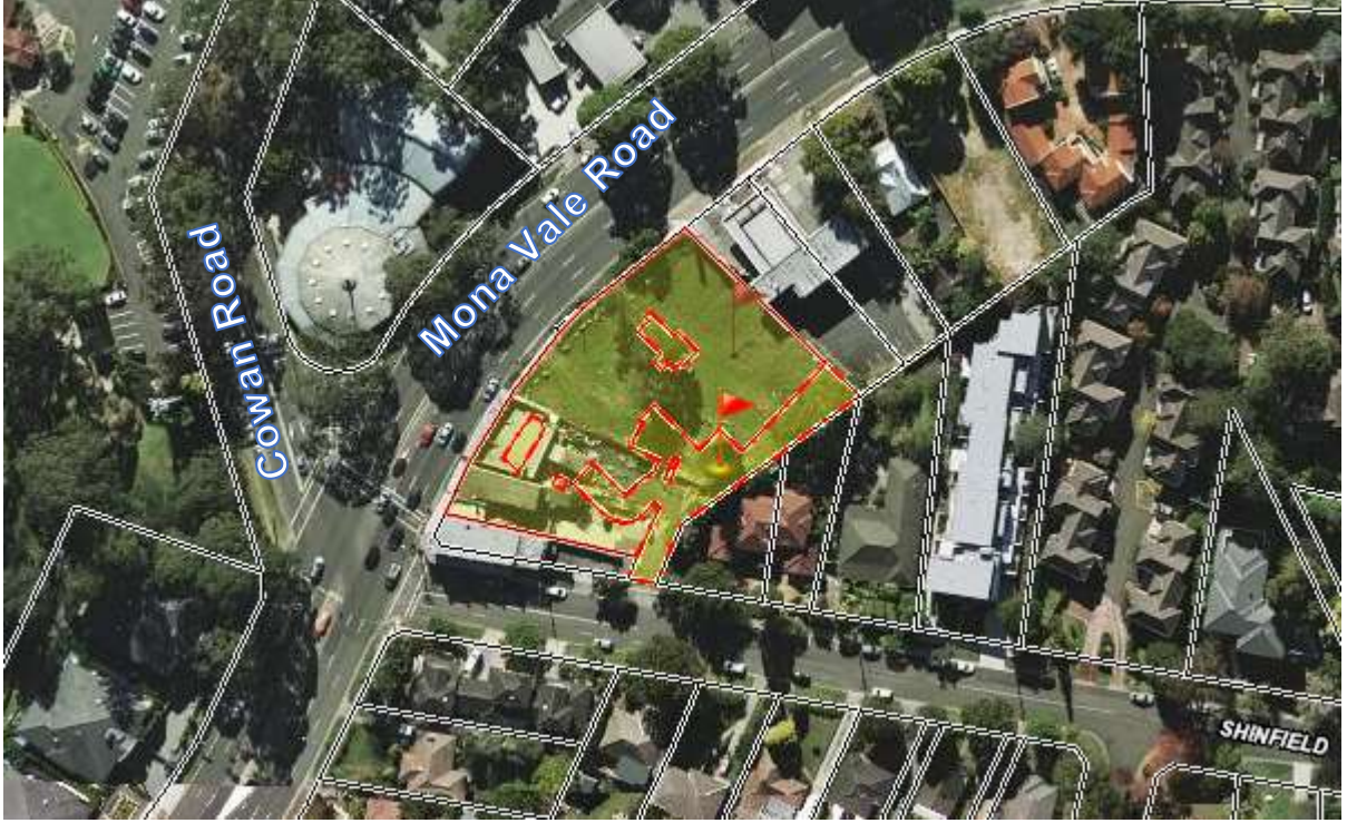
Figure 5: Aerial view of 169-177 Mona Vale Road St Ives (the 'subject land')

For abundant clarity, the intended outcome does not require a rezoning or mapping changes.