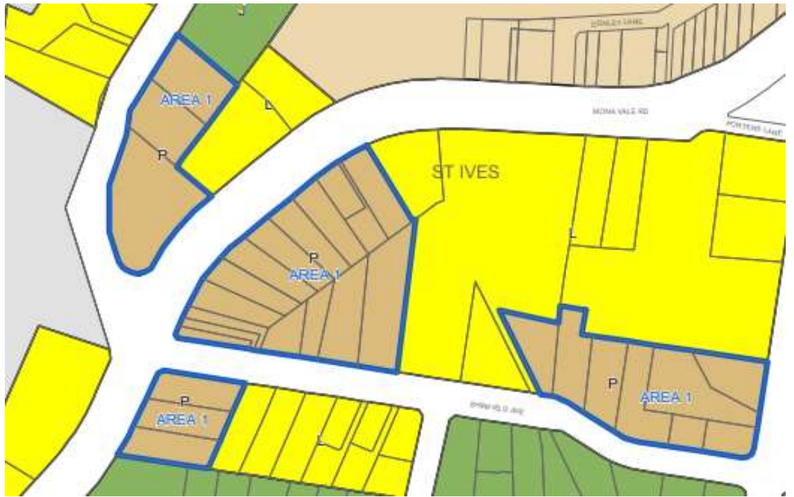
Figure 9: Extract from LEP height of buildings map of 169-177 Mona Vale Road St Ives. No changes are required to this map.