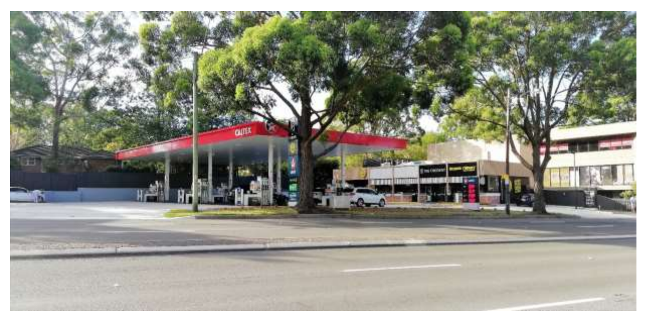
Figure 2: The streetscape opposite the subject site looking north - Caltex service station with fast food outlets