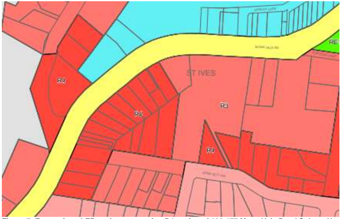
Figure 7: Extract from LEP zoning map noting R4 zoning of 169-177 Mona Vale Road St Ives. No changes are required to this map.

No changes to mapping is required for this planning proposal.