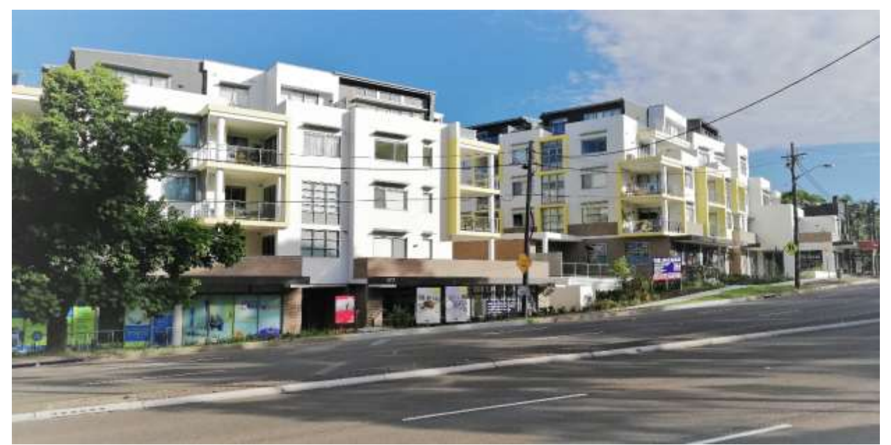
Figure 1: The subject premises – 169-177 Mona Vale Road St Ives

Other permissible uses in the current R4 zone are Attached dwellings; Bed and breakfast accommodation; Boarding houses; Building identification signs: Business identification signs; Centre-based child care facilities; Community facilities; Dwelling houses; Environmental protection works; Exhibition homes; Flood mitigation works; Home-based child care; Home businesses; Home industries; Hostels; Multi dwelling housing; Neighbourhood shops; Places of public worship; Recreation areas; Residential flat buildings; Respite day care centres; Roads; Seniors housing; Shop top housing.