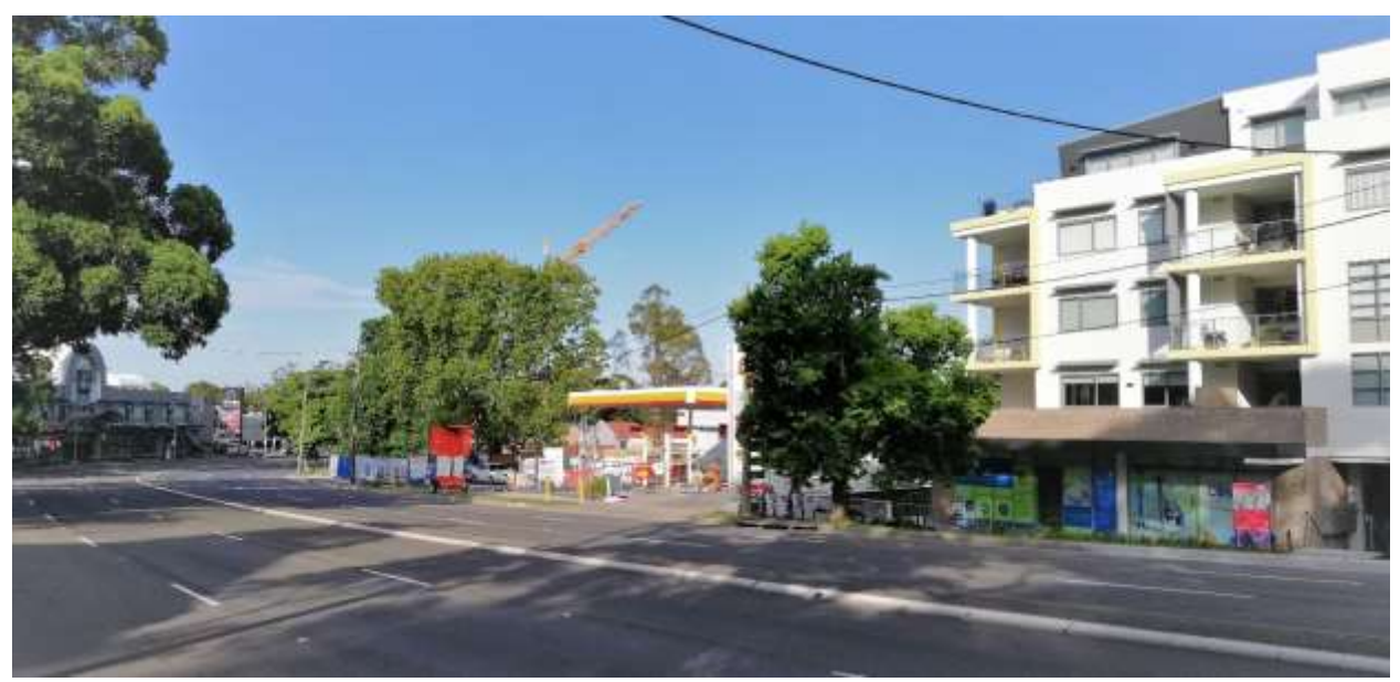
Figure 4: The streetscape adjacent to the subject site looking north east – Shell service station