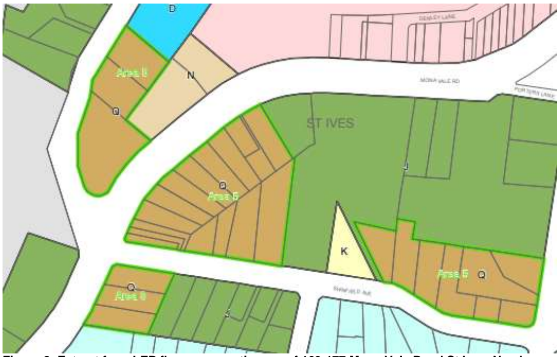
Figure 8: Extract from LEP floor space ratio map of 169-177 Mona Vale Road St Ives. No changes are required to this map.