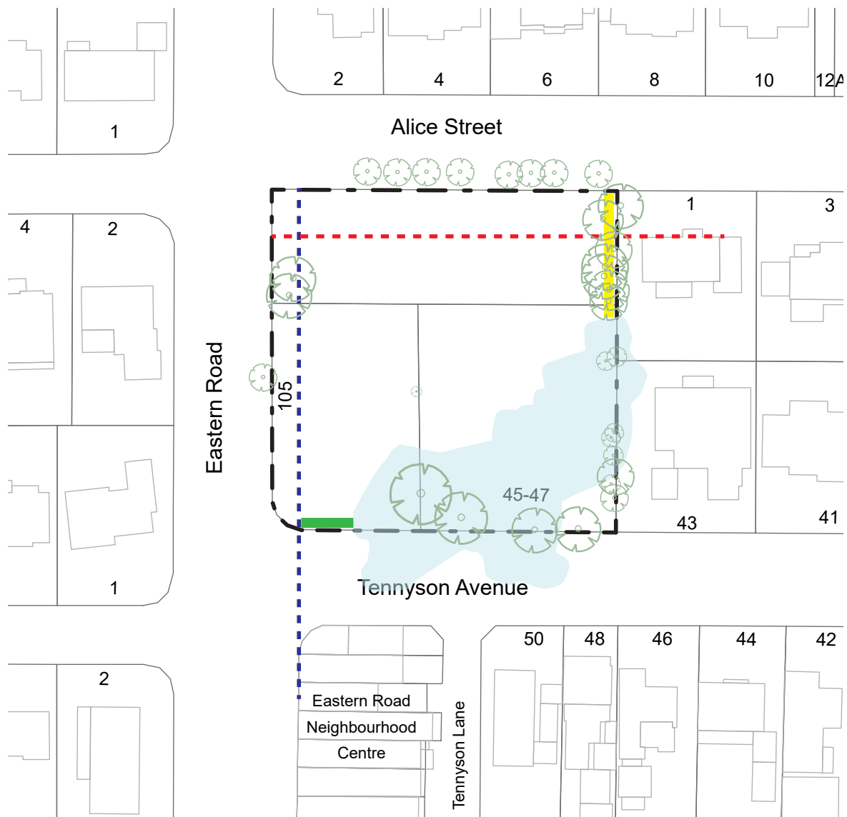
Figure 14D.3-1: Building Setbacks Plan