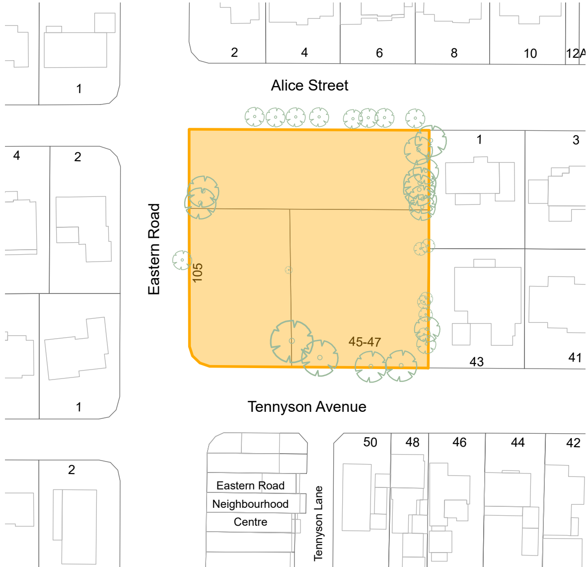
Figure 14D.1-1: Planned Future Character Plan