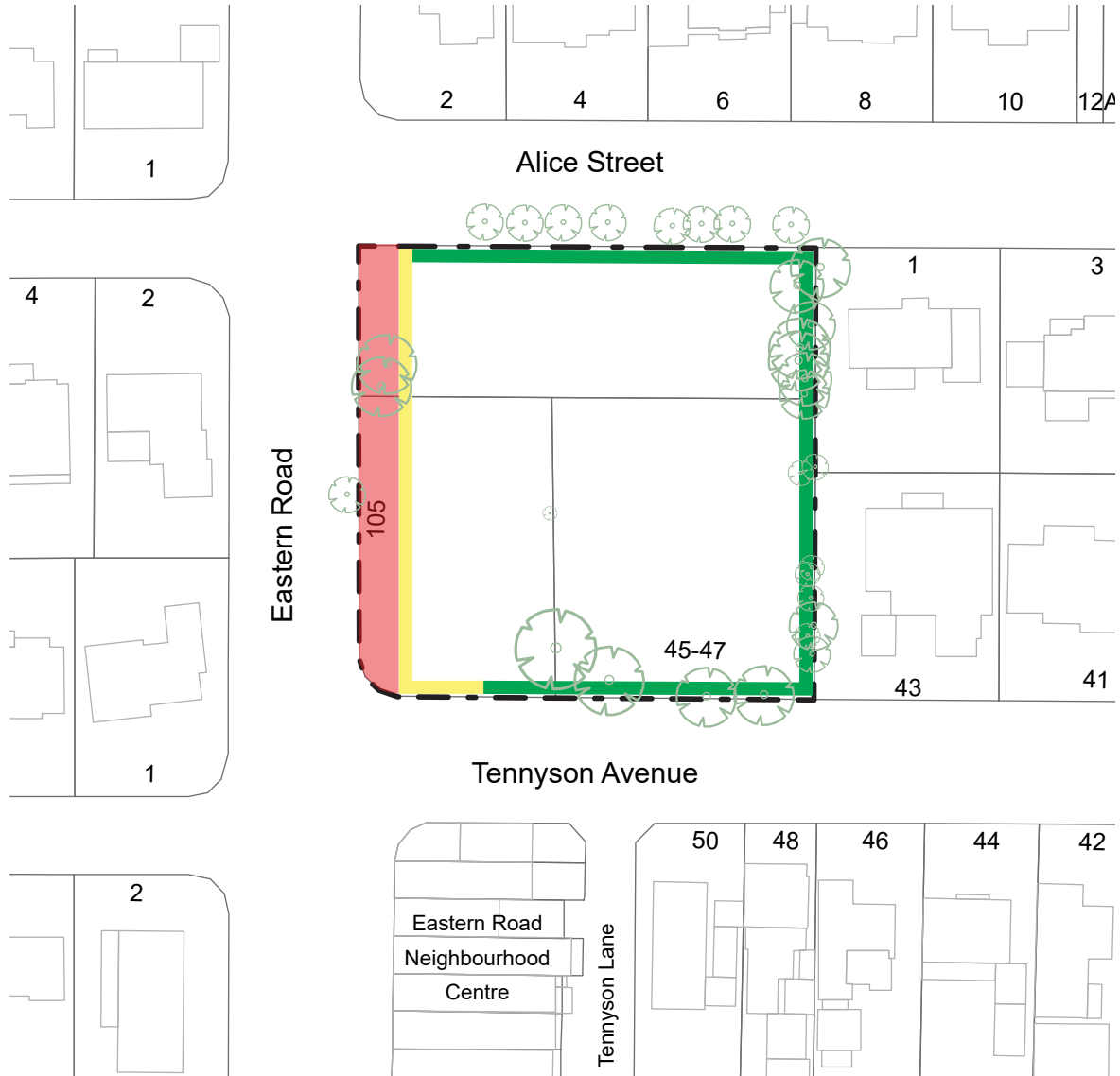
Figure 14D.4-1: Built Form Plan