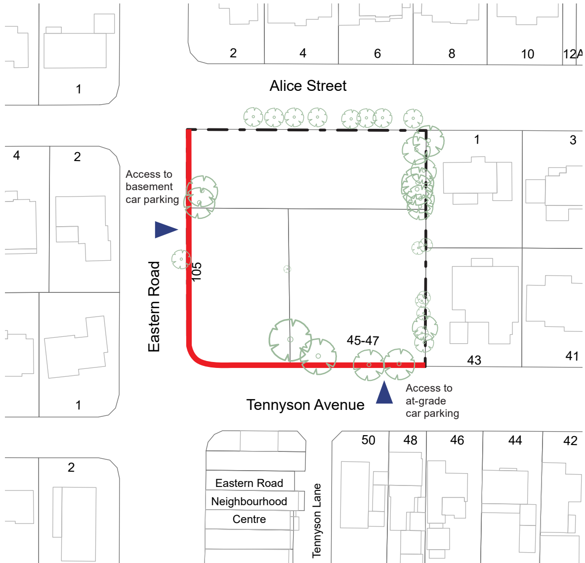
Figure 14D.2-1: Pedestrian and Vehicular Access Plan