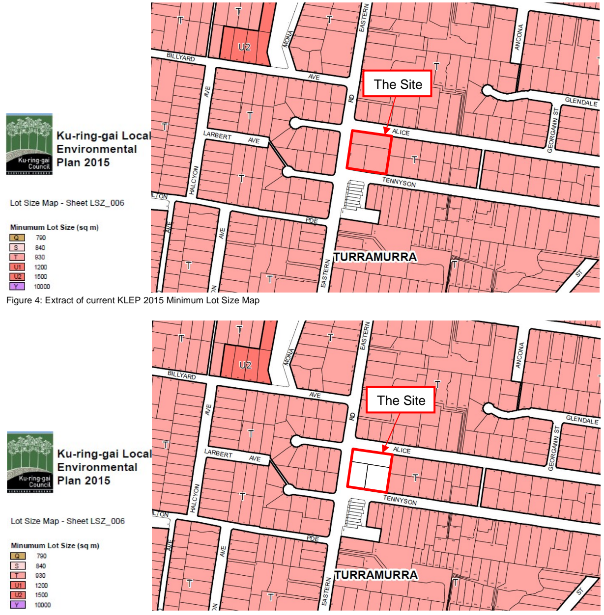
Figure 5: Proposed Amended KLEP 2015 Minimum Lot Size Map

The subject Planning Proposal does not require any amendments to any other maps forming part of KLEP 2015, given that the existing maximum building heights and FSR are not proposed to be changed.