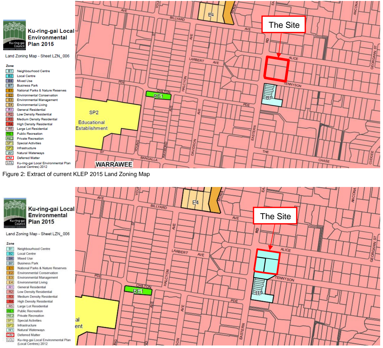
Figure 3: Proposed amended KLEP 2015 Land Zoning Map

The proposed amendment to the KLEP 2015 Zoning Map is identified in Figures 2 and 3 below: